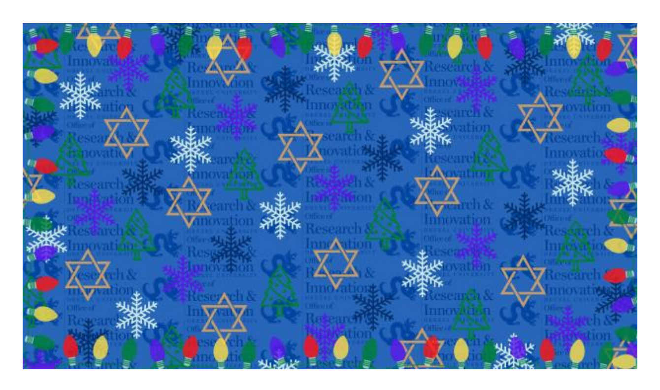
Office of Research & Innovation Newsletter · December 2020